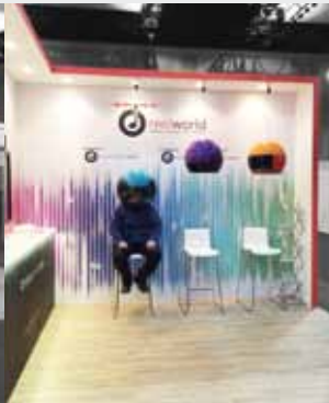
Radiodays, CCD Dublin, Ireland