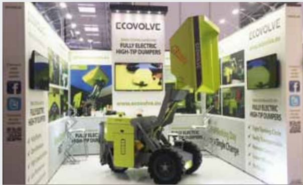
ECOVOLVE LTD Bauma Trade Fair, Messe Munich, Germany