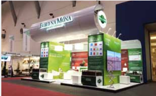
BORD NA MÓNA PROFESSIONAL

We specialise in UK and European Exhibitions