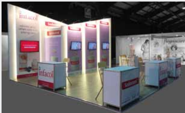
FOREST LABORATORIES SUDOCREM

The Irish Pregnancy and Baby Fair, RDS Dublin