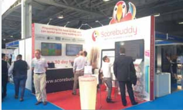
SENTIENT SOLUTIONS / SCOREBUDDY Call Centre Expo Olympia London, UK